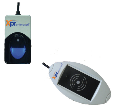
Fingerprint & IP Reader